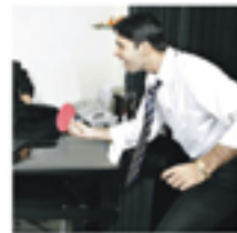
Indoor Gaming Zone