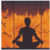
Yoga & health centre