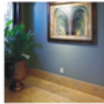
Spacious and Well-Designed Foyer