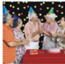
Women & Old People Gathering