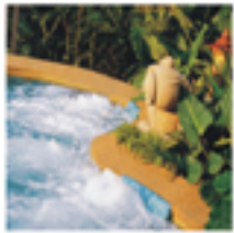
Well-Landscaped Garden With Water Bodies