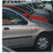
Two Car Parking For Each Apartment