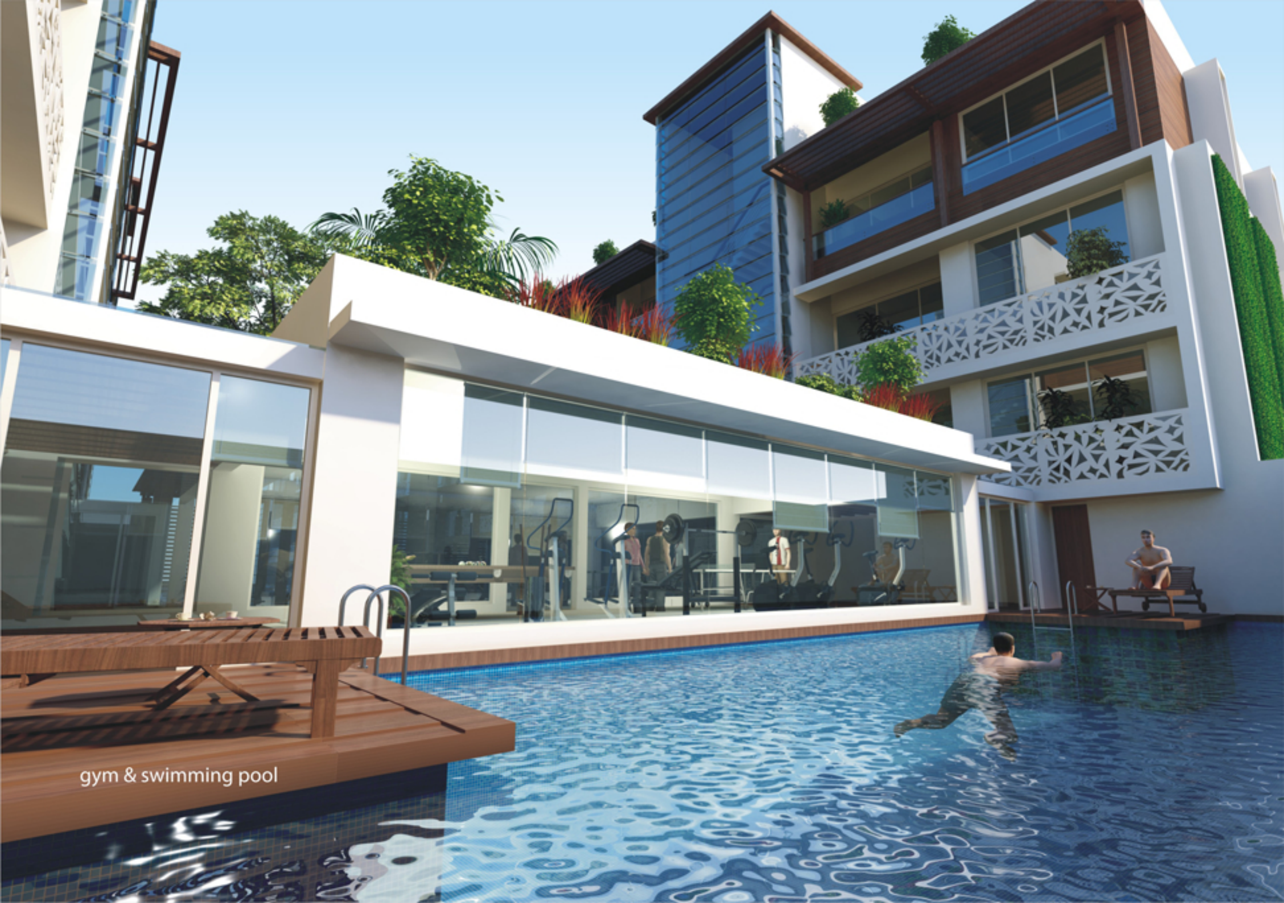
gym & swimming pool