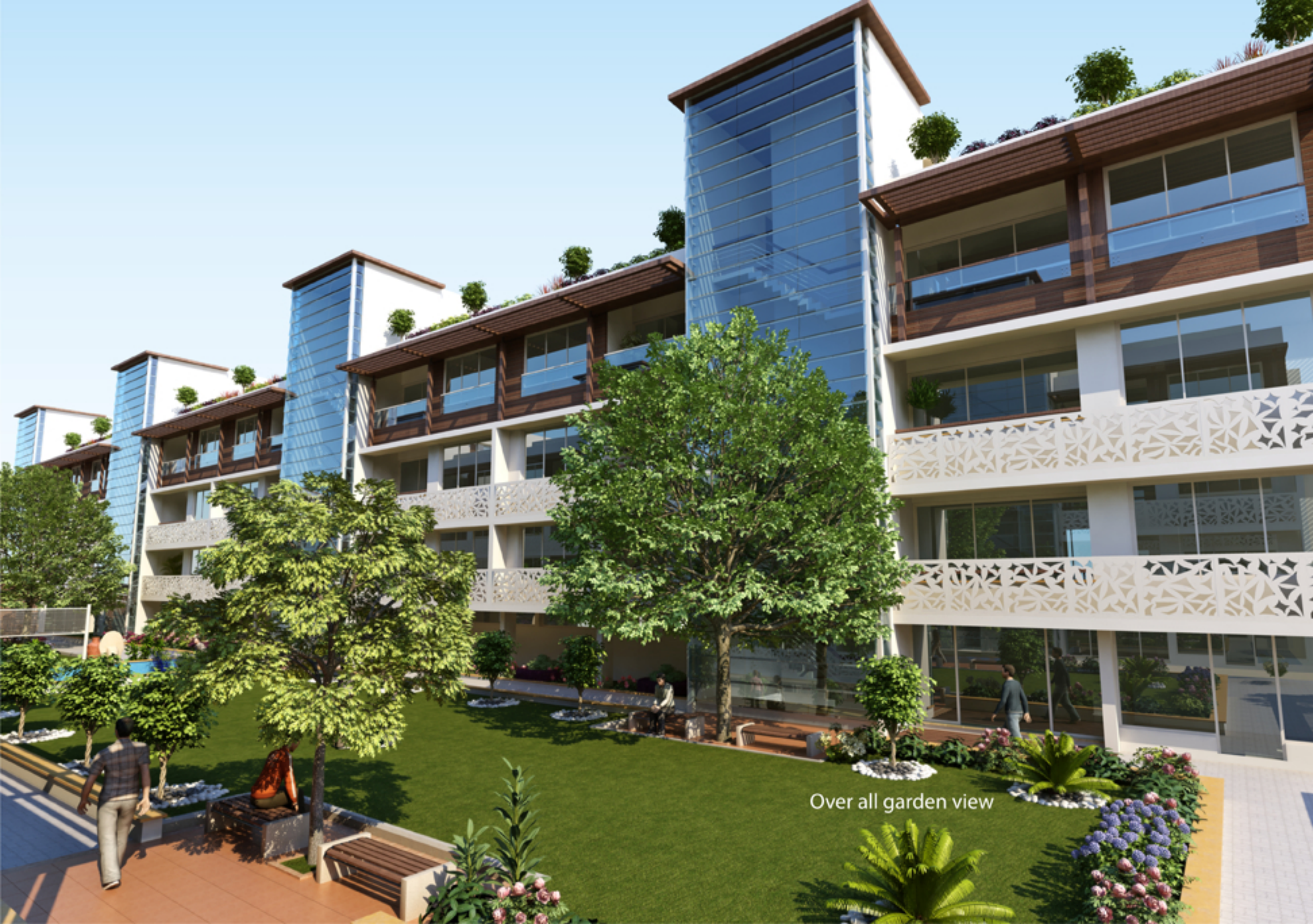
Over all garden view