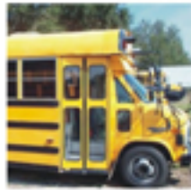
School Bus Pick-up Zone