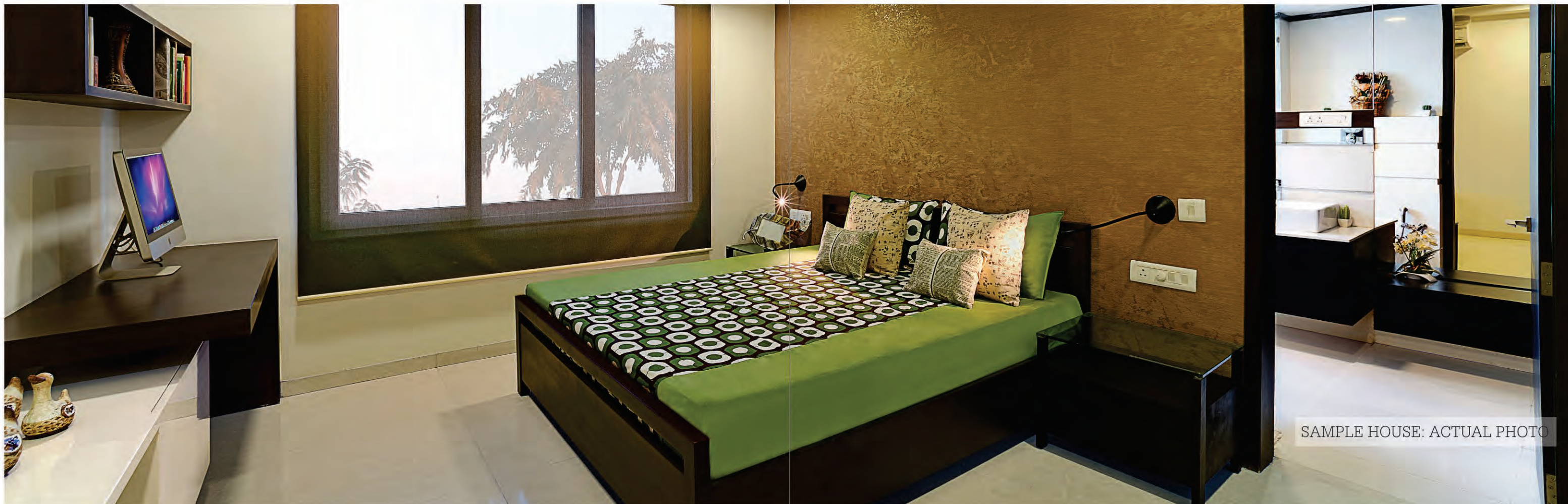
SAMPLE HOUSE: ACTUAL PHOTO