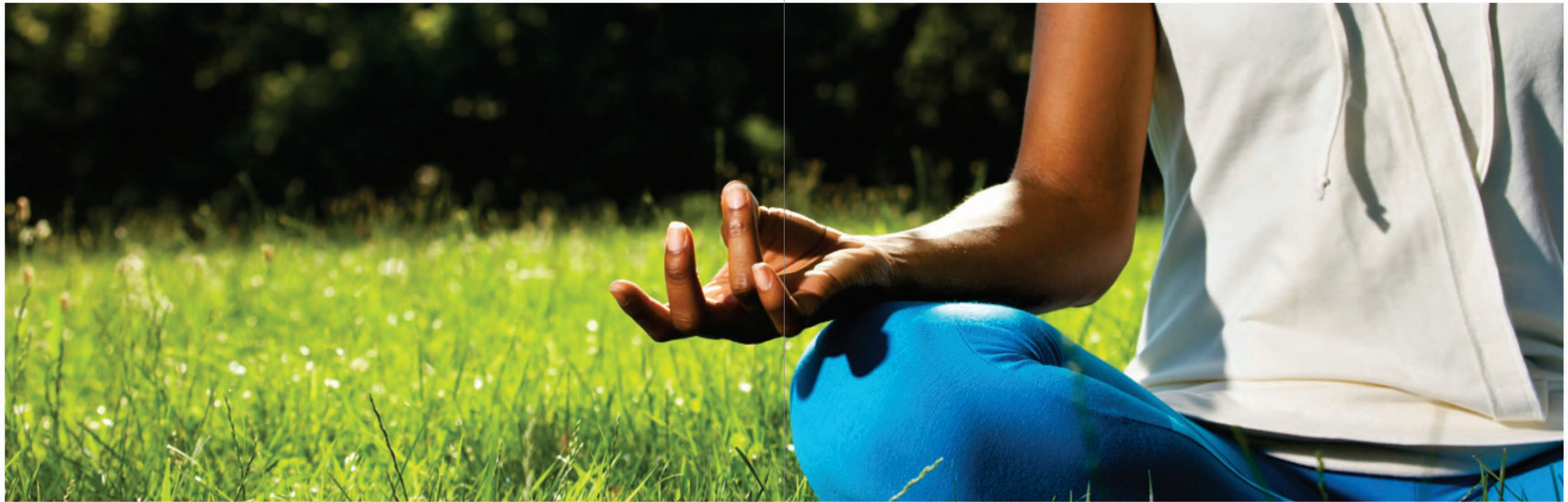
WELLNESS WITH HIGH LIFE A perfect blend of nature and health.