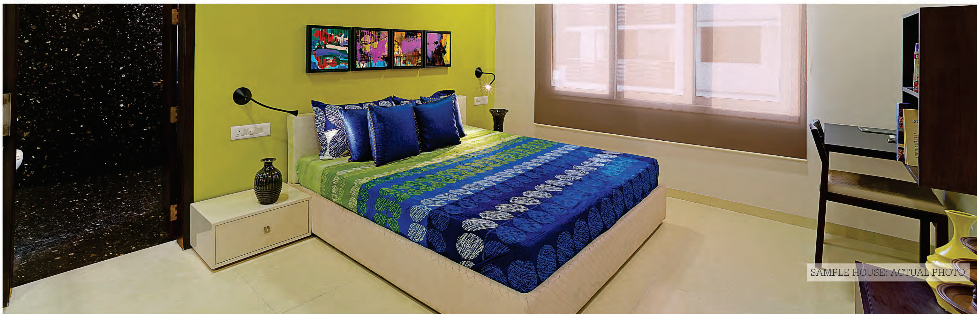
SAMPLE HOUSE: ACTUAL PHOTO

This hospitality service at epitome provides your guest the perfect comfort to indulge in their private space.